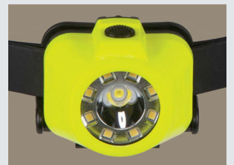
Single switch on top of light for simplified control