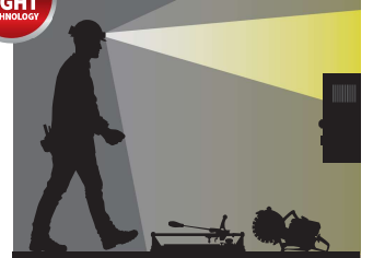
Dual-Light™ spotlight and floodlight at the same time