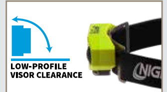
Low Profile for Visor Clearance , on most helmets & hard hats.