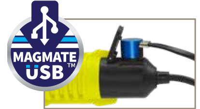
MAGMATE™ Magnetic Coupler USB Rechargeable.