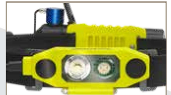
Enlarged front-mounted dual switches , easily toggle through the beam options with gloves on.