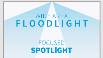
Dual-Light Technology , focused spotlight and area floodlight at the same time.